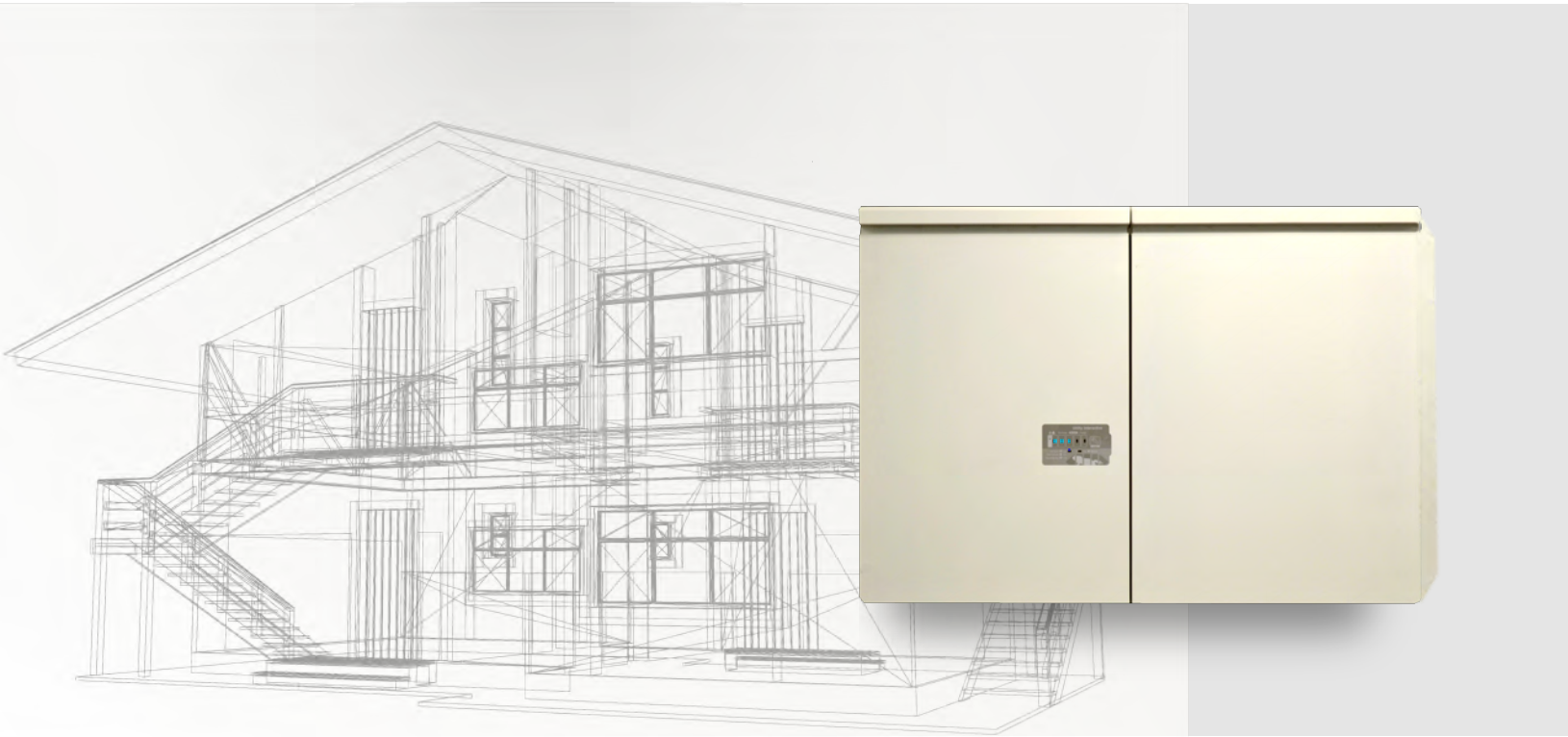
Evolve with 13 kWh capacity shown.